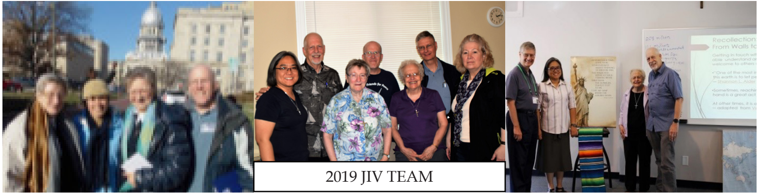
2019 JIV TEAM

Now we commemorate the celebration of the 10th Anniversary of the Joint Immigration Venture and here are the events in March, 2019.